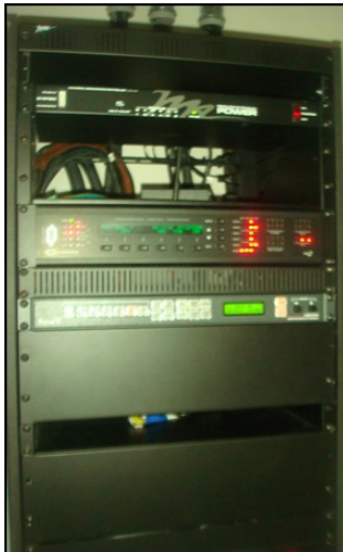
Control Rack Equipment

Displays for the system include a projector, three plasma's, one 52" touch display that can be oriented between landscape and portrait, and four other 22" touch monitors for the judge, witness, clerk, and A.D.A. display. The touch screen displays are used for annotation of any source material in the system.