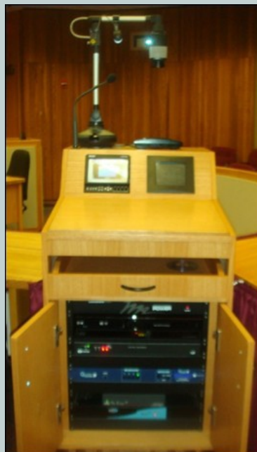
Podium/Lectern with document camera, DVD Combo Unit and inputs for laptops utilized by attorneys.

All annotation as well as routing of video to each display is controlled via the Judge or Clerk of Court.